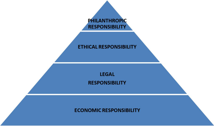
SOCIAL RESPONSIBILITY PYRAMID